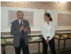
□ OLYMPUS DIGITAL CAMERA