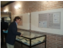
□ OLYMPUS DIGITAL CAMERA