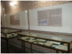
□ OLYMPUS DIGITAL CAMERA