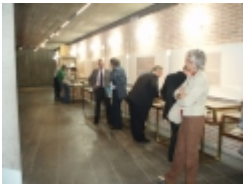
□ OLYMPUS DIGITAL CAMERA