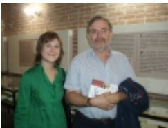
□ OLYMPUS DIGITAL CAMERA