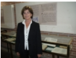
□ OLYMPUS DIGITAL CAMERA