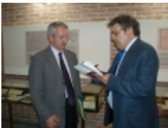
□ OLYMPUS DIGITAL CAMERA