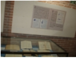
□ OLYMPUS DIGITAL CAMERA