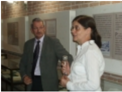
□ OLYMPUS DIGITAL CAMERA